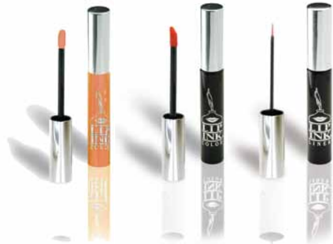
LipGel Lip Sticks Classic Liquid Color Liquid Lip Liner

LIP-INK® LIQUID LIP LINERS: Outline, enhance, and define your lips with our ultra-durable, patented formula. Mix and match with LIP-INK® COLORS for a sultry, sexy, stay on, splash. Use alone and fill in with the TINTED SHINE MOISTURIZER or TINTED WAXLESS LIP BALM™ for an irresistibly radiant look.