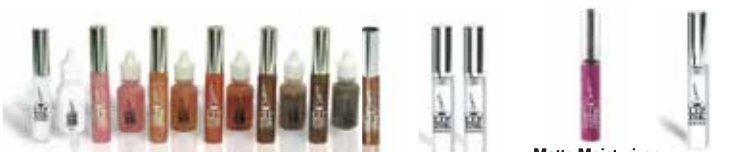
Tinted Shine Lip Moisturizers / Tinted Shine Plus 8 Additional Brilliant Tinted Shine Lip Plumper Moisturizers (No Picture Available) Flavored Shines (available in a multitude of flavors) Matte Moisturizer Lip Stain Hyper Shines/ Matte Shine

LIP-INK® SHINE / MOISTURIZER / TINTED SHINE / FLAVORED SHINE / HYPER SHINE / BRILLIANT TINTED SHINE LIP PLUMPER / MATTE SHINE / MATTE LIP STAIN: This acts as a base conditioner when applied underneath LIP-INK® CLASSIC COLOR, and over the top of LipGel Lip Stick. A light layer on top creates a moist silky feeling. A more generous application transforms a matte finish into a high gloss shine. Contains age-fighting anti-oxidants, vitamins, and moisturizers that hydrate, soothe, and condition your lips. Natural light reflectors ease the signs of sun damage. Available in NATURAL (no color), FLAVORED, HYPER SHINE (our thicker formula) and TINTED formulas. Brilliant Tinted Shine Lip Plumper Moisturizers are like candlelight brilliance on your lips, building thicker fuller lips with dove/liquorice flavor and 3D Lipmax™ Volumizer. A light layer of LIP-INK® MATTE SHINE MOISTURIZER™ on top creates a moist matte silky feeling. LIP-INK® MATTE SHINE MOISTURIZER™ goes on with a sheen and quickly transforms to a silky matte finish. All moisturizers can be layered to create your own personalized moisturized palette. LIP INK® MATTE MOISTURIZING LIP STAIN Is a wax free lip stain matte moisturizer available in natural earth tone colors that provides beautiful, long-lasting color.