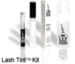
Lash Tint™ Kit

Guaranteed Smear Proof, Waterproof & Long Lasting