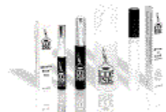
MIRACLE BROW TINT KIT

Guaranteed Smear Proof, Waterproof & Long Lasting